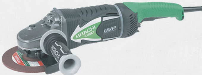
7" Hand Grinder with Dust Shroud