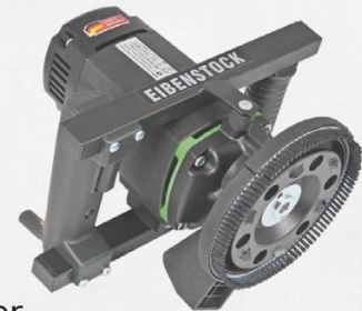
5" Hand Grinder