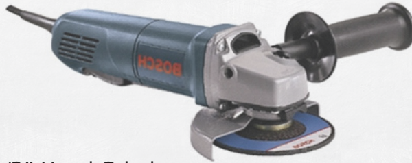
4-1/2" Hand Grinder